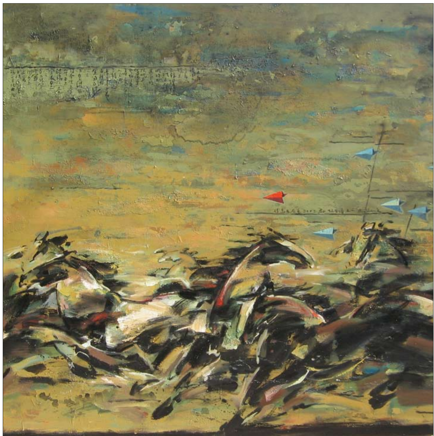
Flying With The Wind 1