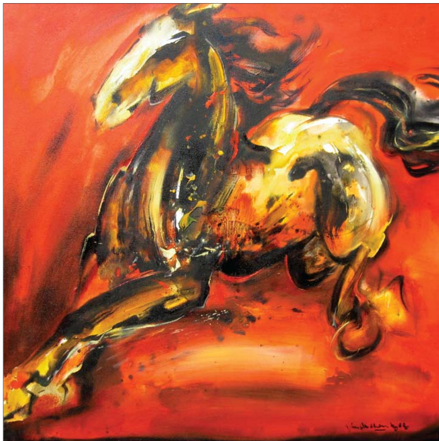
Flying With The Wind 19