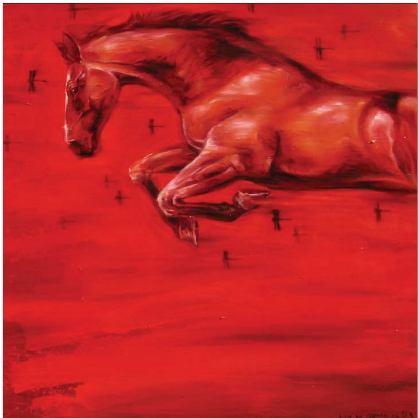
Flying With The Wind 11