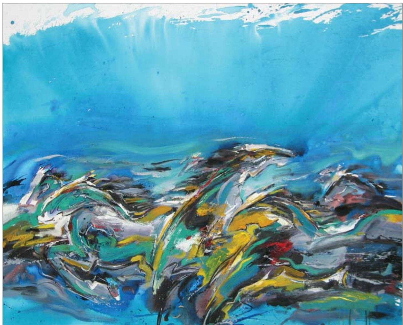
Flying With The Wind 38