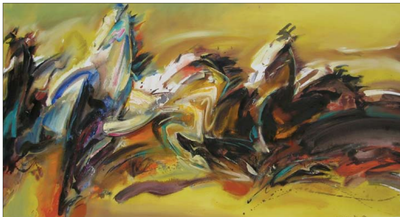
Flying With The Wind 15