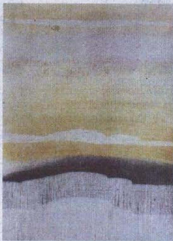
"SATORI: Clouds" Series IV